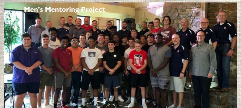
Men's Mentoring Project