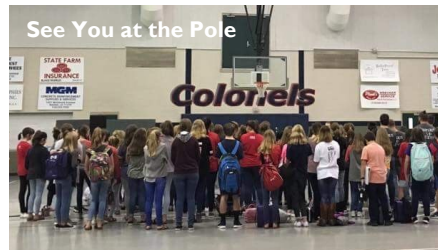
See You at the Pole