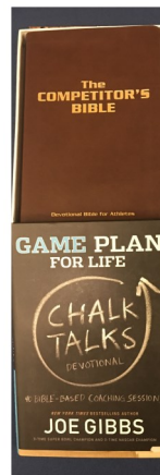
GAME PLAN FOR LIFE CHALK TALKS EVOTIONAL BIBLE-BASED COACHING SESSIONS JOE GIBBS