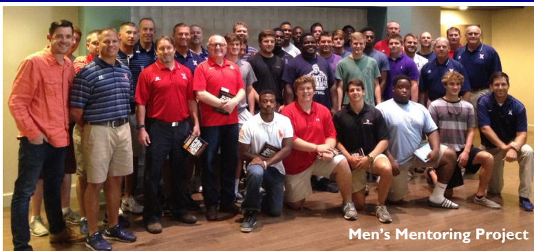
Men's Mentoring Project