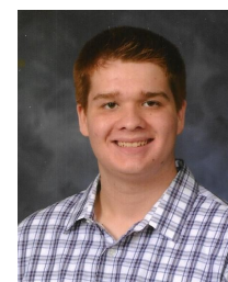
William Spencer MS College