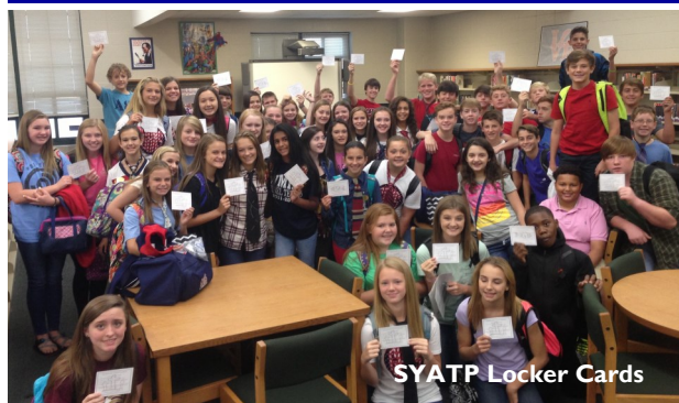
SYATP Locker Cards