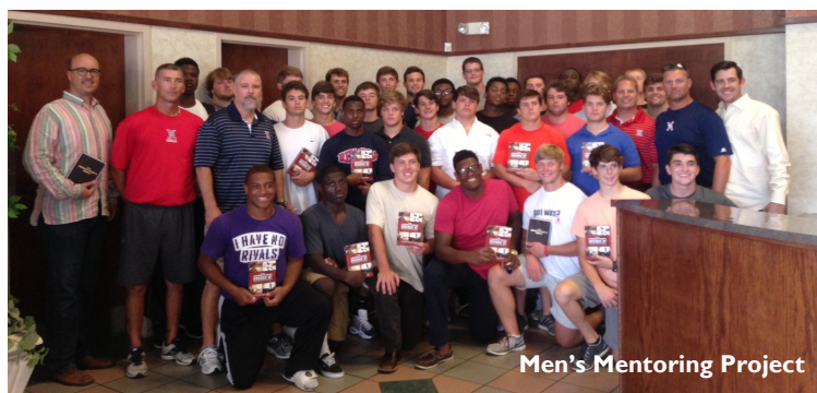
Men's Mentoring Project