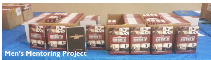
Men's Mentoring Project

The vision of the Jason Paul Cameron Foundation is to make a difference in the lives of area young people. Your gifts provide scholarships to young people who otherwise would be financially unable to attend camps. We pray that these young people will learn of God's love for them through your contributions. Area Youth Pastors may contact the Foundation to request scholarship assistance. Because of your gifts, the JPC Foundation was able to provide assistance to the following: