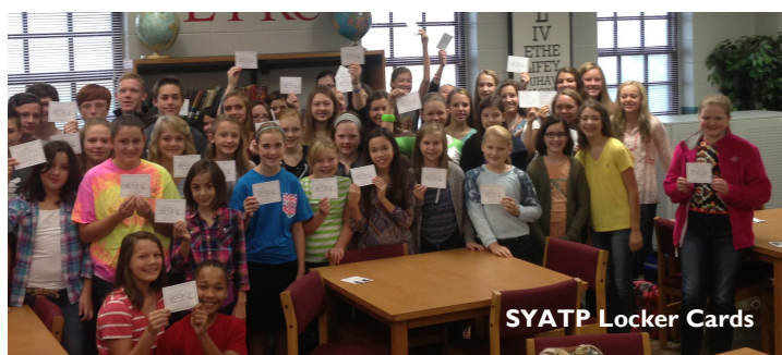
SYATP Locker Cards