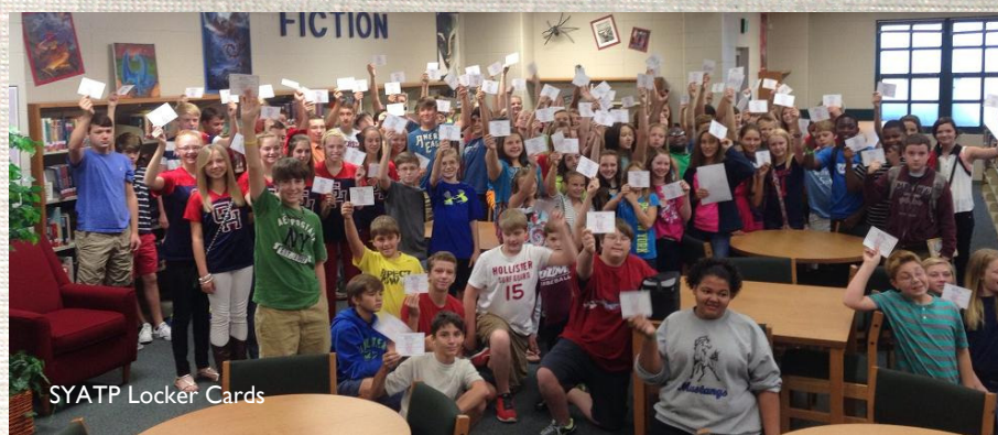
SYATP Locker Cards