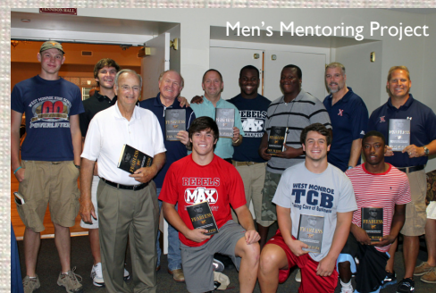
Men's Mentoring Project